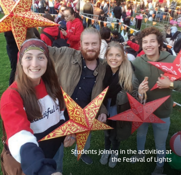
Students joining in the activities at the Festival of Lights